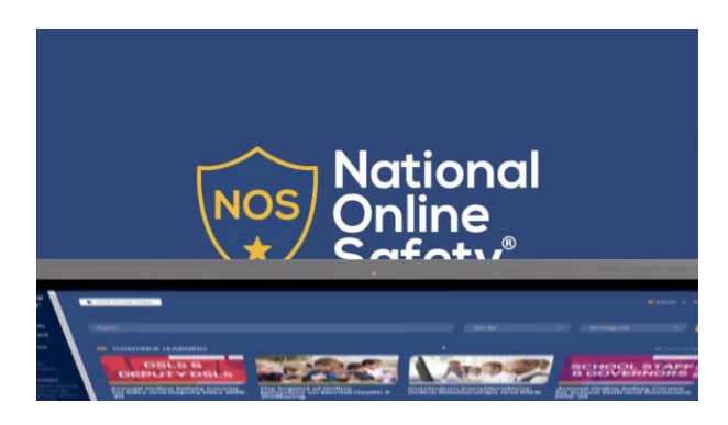
5 - National Online Safety

This week we have emailed you with information on how to sign up for resources, courses and webinars around online safety using the National Online Safety platform. I will shortly add suggested resources to your parent 'watch list' which I believe will be of great support to us all as we keep our children safe in an ever changing environment online. Please do sign up to this fantastic resource which we also use regularly in school. All schools within Emmaus have been provided with this opportunity to support online safety of our children.