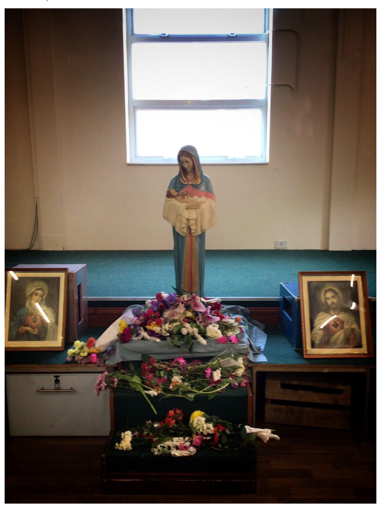
The May Procession at St. Joseph's