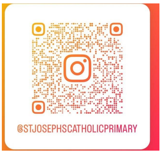
2 - Instagram @STJOSEPHSCATHOLICPRIMARY